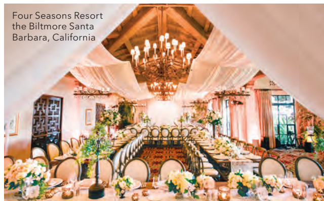
Four Seasons Resort the Biltmore Santa Barbara, California