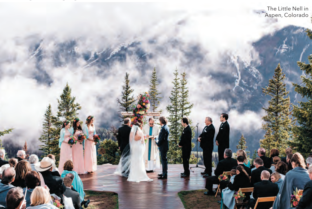
The Little Nell in Aspen, Colorado