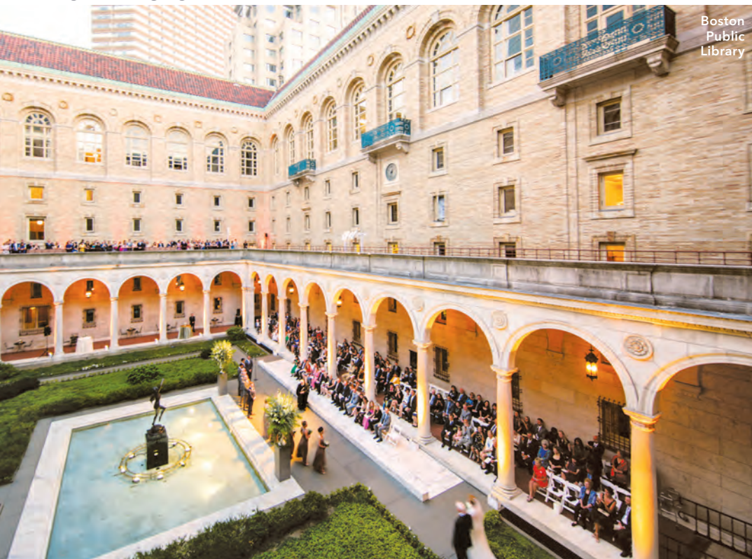
Boston Public Library