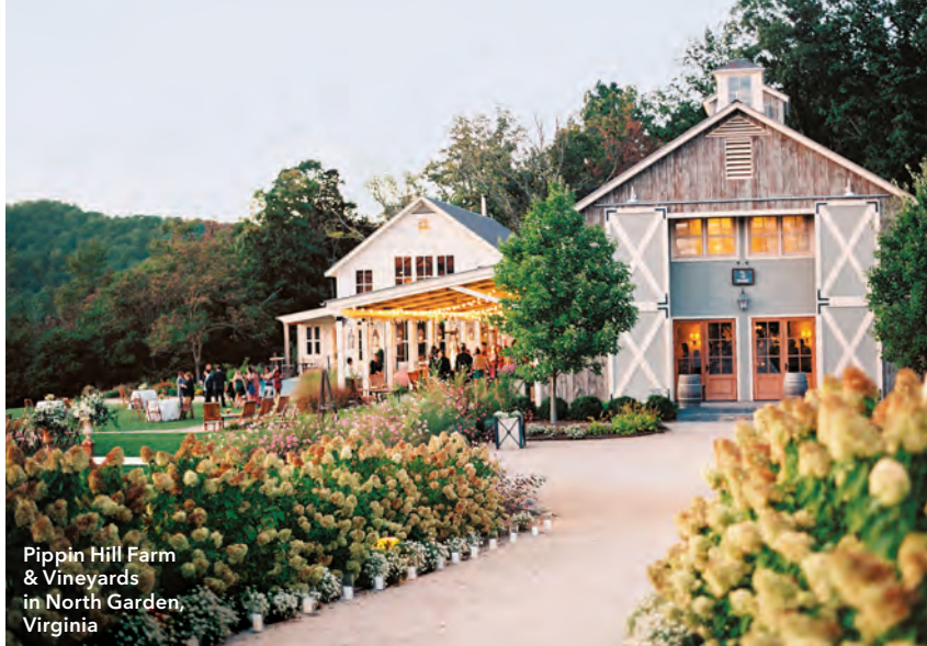
Pippin Hill Farm & Vineyards in North Garden, Virginia

Brides love the staff and spa at this charming Relais & Châteaux hotel, home to