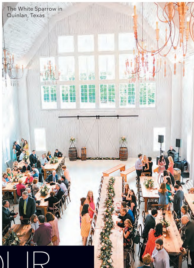
The White Sparrow in Quinlan, Texas