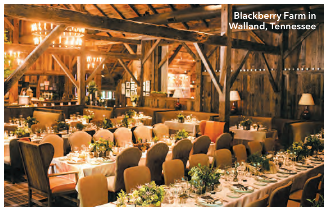
Blackberry Farm in Walland, Tennessee