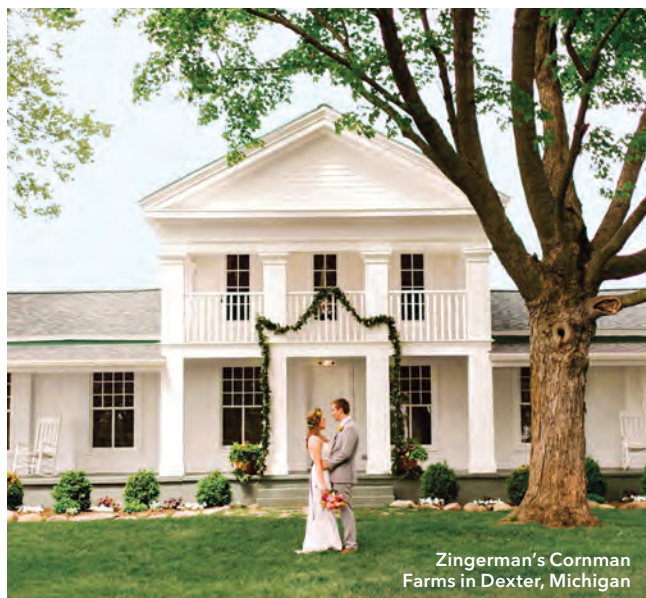
Zingerman's Cornman Farms in Dexter, Michigan