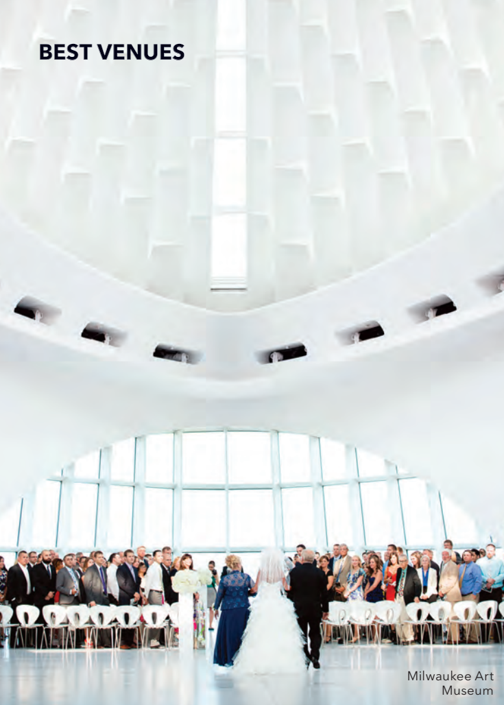
Milwaukee Art Museum