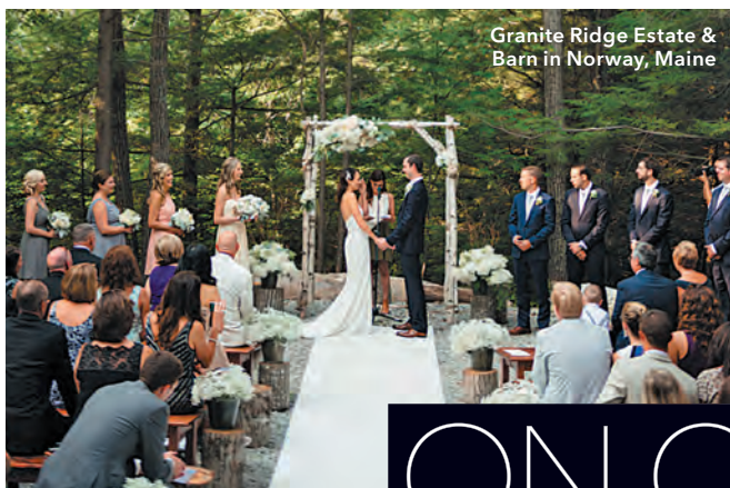
Granite Ridge Estate & Barn in Norway, Maine