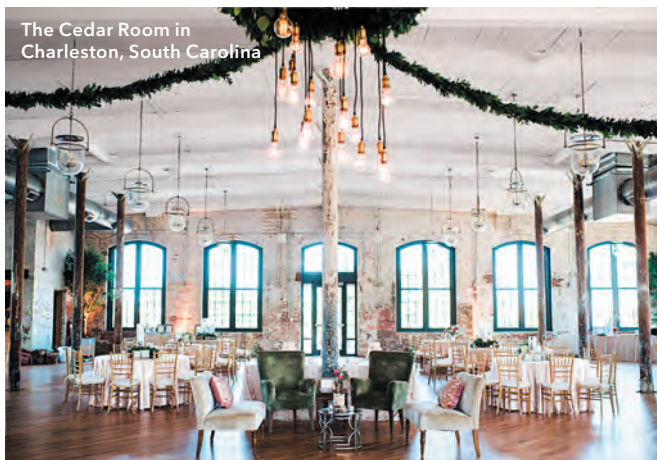
The Cedar Room in Charleston, South Carolina