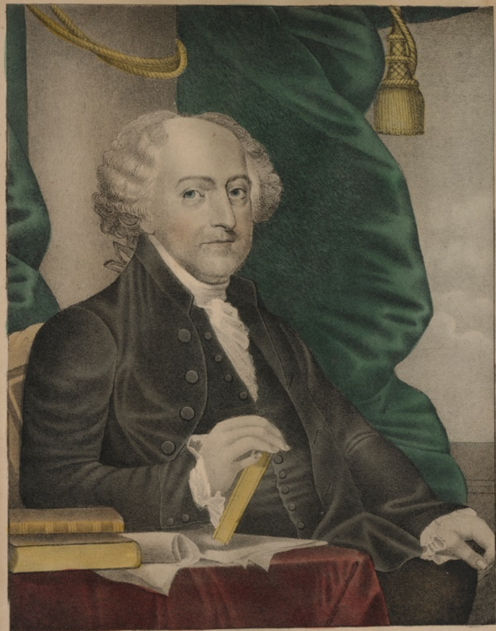
JOHN ADAMS. Second President of the United States.